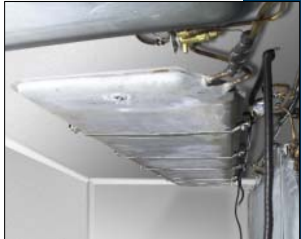
Kidron's Cold Plate System

During the delivery day, you get the combined benefits of Kidron Cold Plate Systems and Kidron refrigerated distribution bodies ... a unique blend of superior refrigeration, construction and thermal efficiency technologies that capably hold the cold better, protecting your perishable cargo.