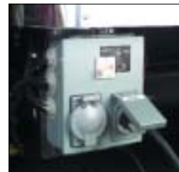
Easy Access Plug-In

For more information, or to see Kidron Cold Plate Systems for yourself, call toll-free: 800-321-5421